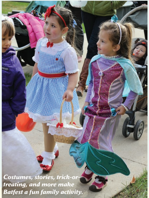
Costumes, stories, trick-or-treating, and more make Batfest a fun family activity.

Trying to decide on a preschool for your child? Stop by the Library for a look at various Batavia and Geneva preschools. The open house format offers parents and caregivers the opportunity to talk to many preschools at one time in one location. No registration required.