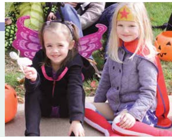
Families can enjoy fall stories in the Reading Garden during BatFest, Oct. 24 (see page 24).

Tues., Sept. 19, 4:30pm Stick Dog by Tom Watson Grades 3–5 Thurs., Oct. 19, 6:30pm The Wild Robot by Peter Brown Grades 4–6 Bring these books to life with activities and conversation. Reserve a copy of the book when registering.